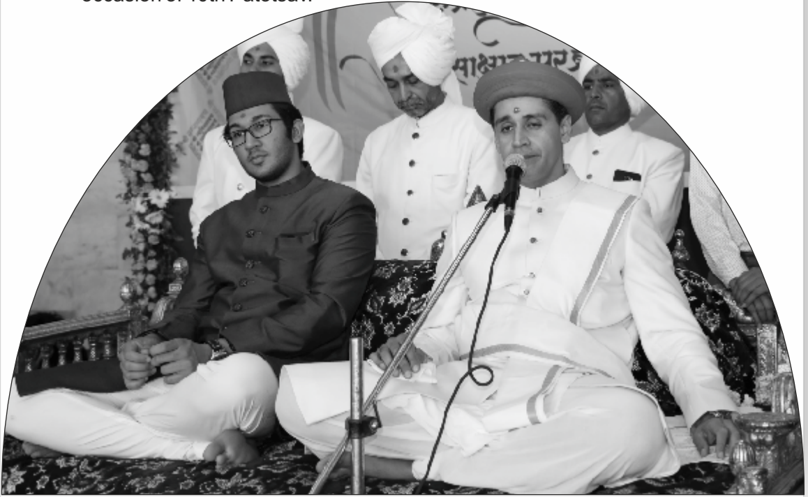
August-2017 • 05